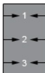
Figure 2 Width, measure top, middle and bottom