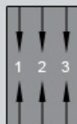
Figure 4 Height Measure left, right and center