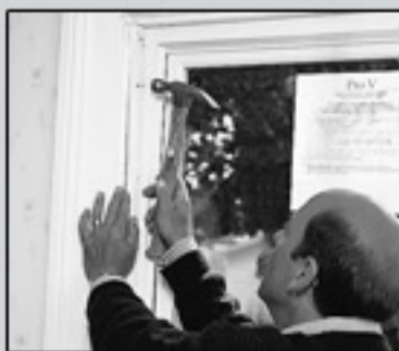
Figure 13 Re-nail the original wood sash stops that were saved in Step One. Install screw hole plugs.