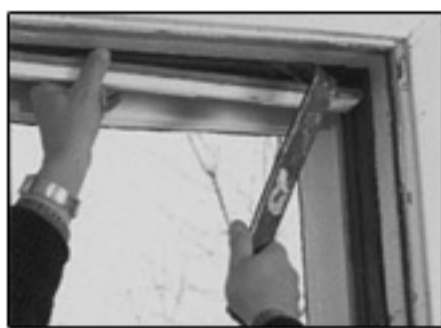
Figure 2 Remove the cords and pulleys. Then take out the old bottom sash.