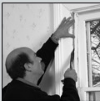
Figure 7 With the window closed and locked, make sure the window frame is level, square and plumb. Shim window to help keep window frame centered and square.