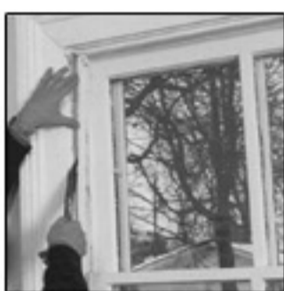
Figure 1 From inside your home, carefully remove the inside stop from the old window with a broad chisel or putty knife. Don't throw these pieces away. You'll need them later.