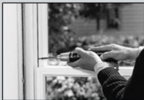
Figure 9 Check for proper operation, locking and fit. Make adjustments as necessary. Center screw is installed to ensure that the width at center of unit equals the width from top to bottom.