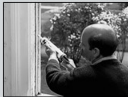
Figure 5 Remove the replacement window from the opening. Caulk the inside edge of the blind stop along the jambs and along the head.