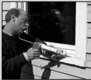
Figure 11 Run a bead of caulk on the exterior seam where the Sill Filler meets the frame and the vinyl window meets the Blind Stop.