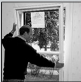
Figure 6 Insert the replacement window into the opening by tilting the bottom of the window onto the sill. Press the window tightly against the caulked stops.