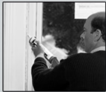
Figure 12 Caulk interior where replacement window and wood frame meet (on the sides and along the top).