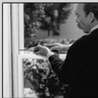
Figure 8 Secure the replacement window using the wood screws provided.