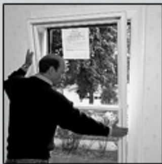
Figure 4 Trial fit the window into the opening. Install the head expander if needed.