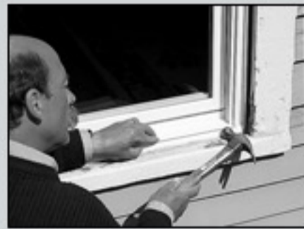
Figure 10 Insert Sill Filler into the accessory groove. Tap into place using a rubber mallet.